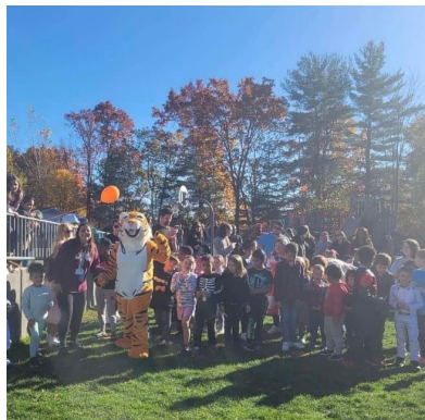
Torrington students, staff, and Torrey had loads of fun at the Pumpkin Dash this past October!