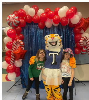
Lots of fun was had at the PTO's annual winter event: What Do Snowmen Do At Night?