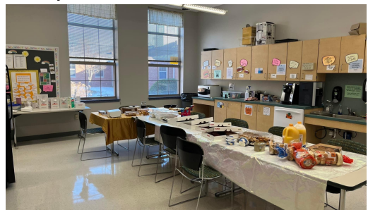
Teacher and Staff Appreciation Holiday Brunch