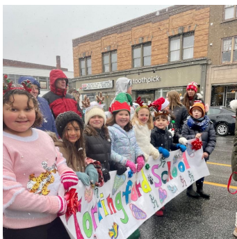
Torrington's Student Council organized the annual Christmas Village Parade - it even snowed!